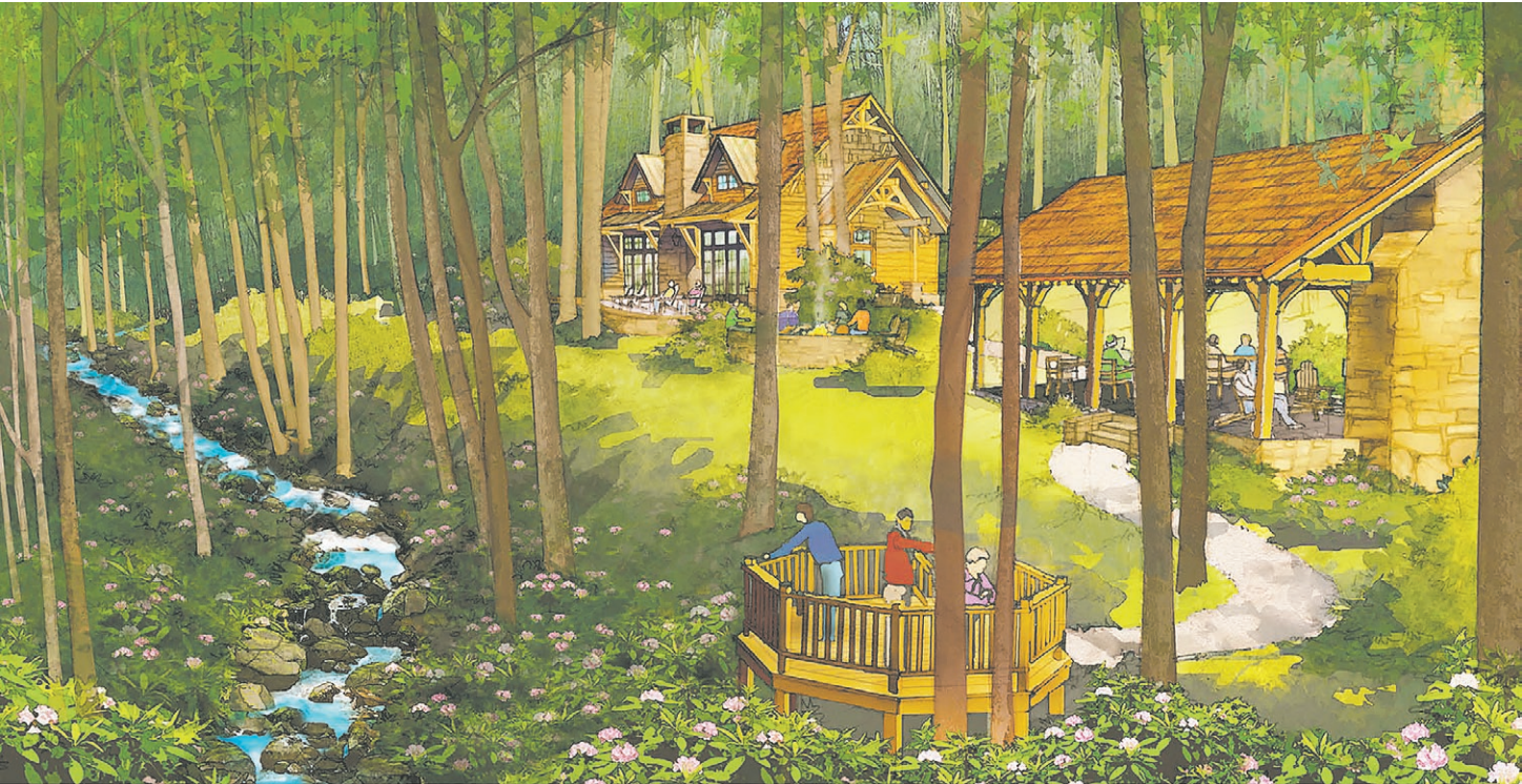
The Cove at Celo Mountain